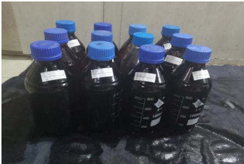
Labelled sample bottles 09/10/2024