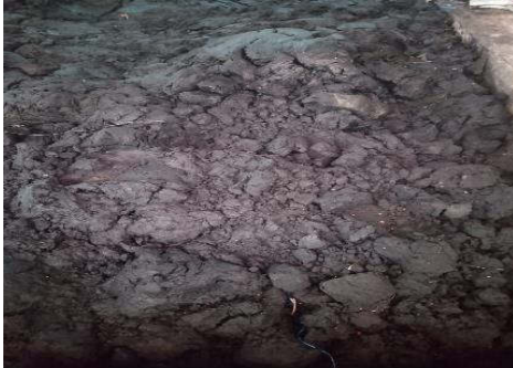
Sampling point 09/10/2024