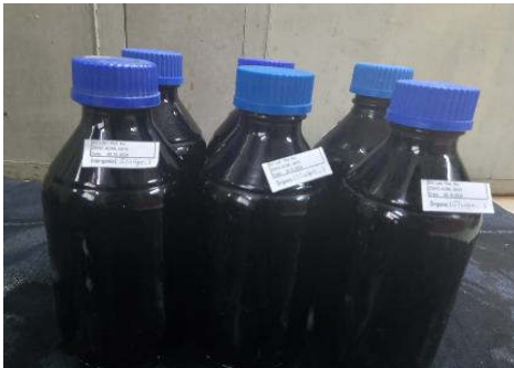
Labelled sample bottles 09/10/2024