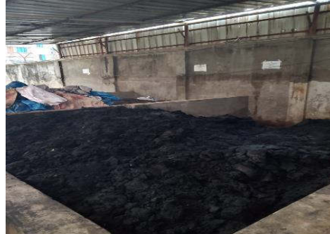
Sampling point surrounding environment 09/10/2024