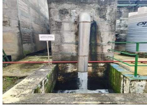
Sampling point surrounding environment 09/10/2024