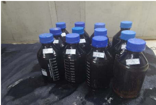
Labelled sample bottles 09/10/2024