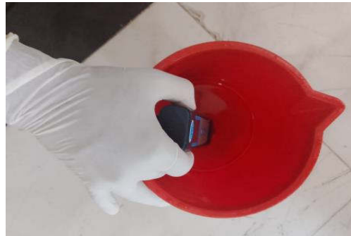
pH measurement 09/10/2024