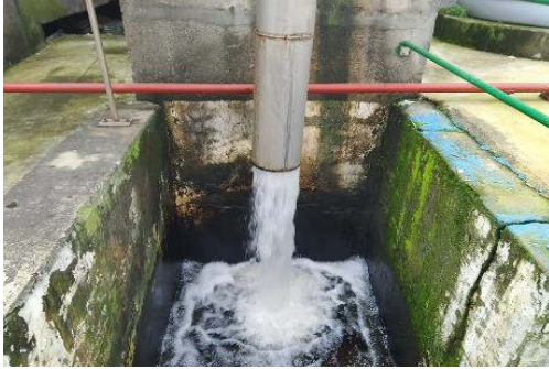
Sampling point 09/10/2024