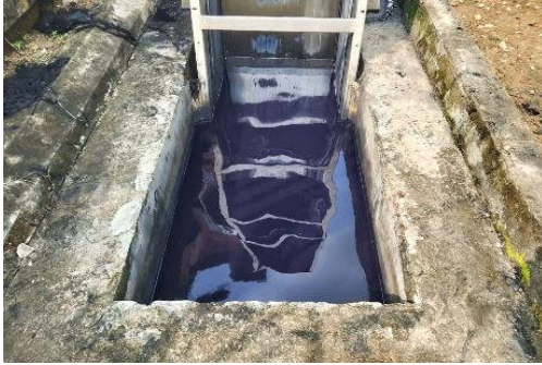
Sampling point 09/10/2024