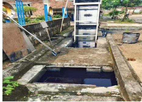
Sampling point surrounding environment 09/10/2024