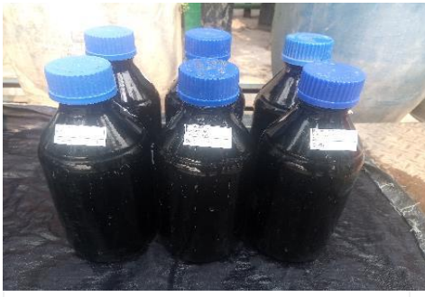
Labelled sample bottles 18/3/2024, 16:44