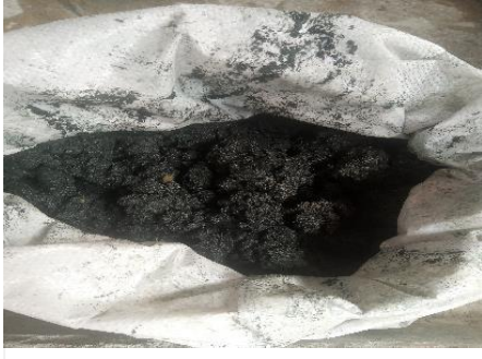
Sampling point 18/3/2024, 14:34