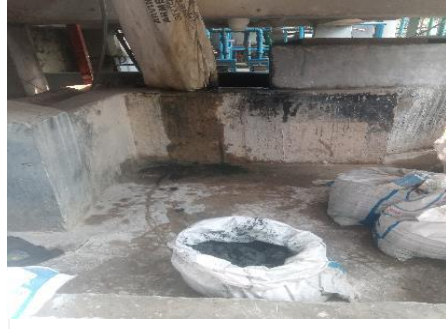
Sampling point surrounding environment 18/3/2024, 14:34