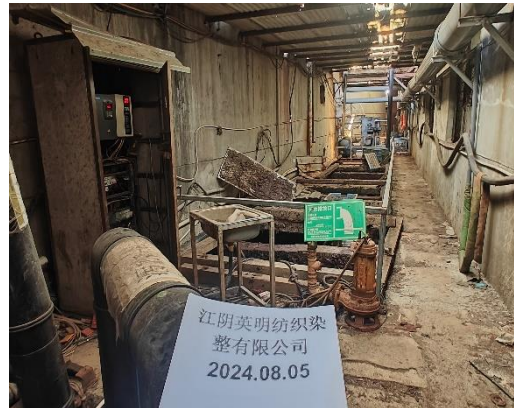
Sample 1 – Sample for Phthalate Test [05/08/2024 & 10:30]