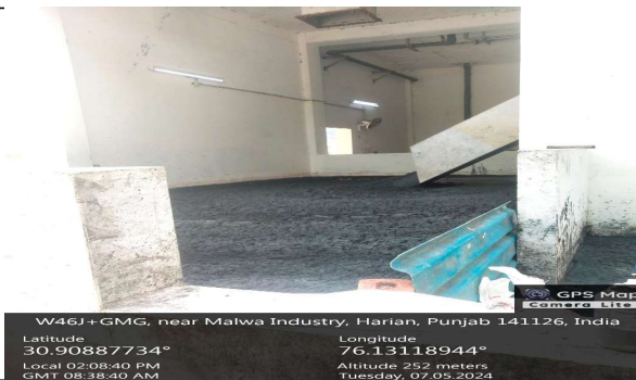
Photo of effluent