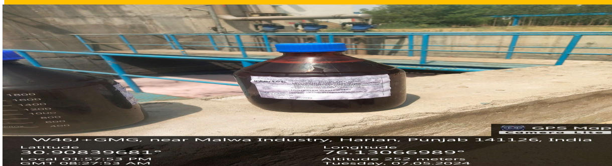
Photo of untreated wastewater