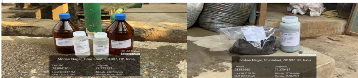
Photo of effluent