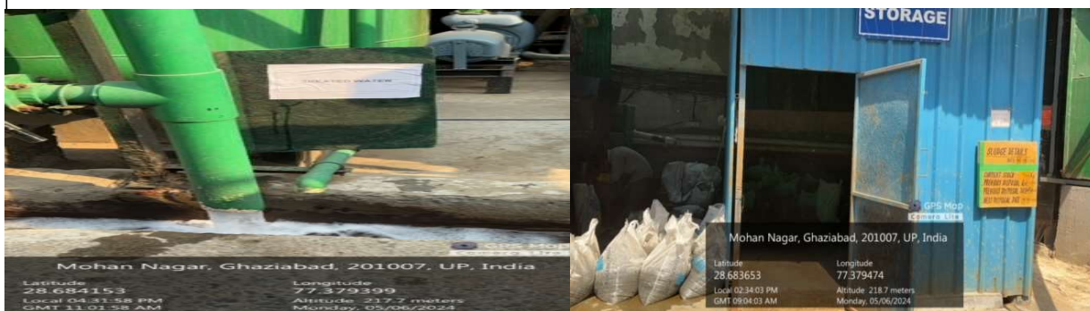
Photo of effluent