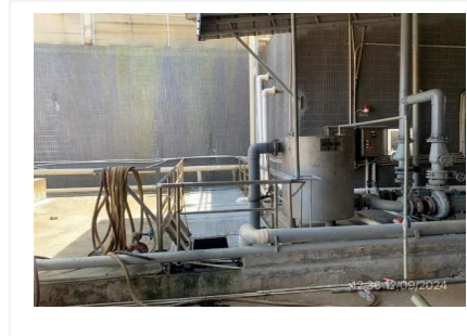
Sampling point surrounding environment 12/09/2024, 12:36