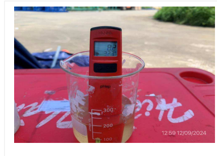
pH measurement 12/09/2024, 12:59