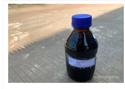
Sample for phthalate test 12/09/2024, 13:35