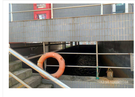
Sampling point surrounding environment 12/09/2024, 12:55