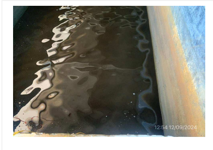
Sampling point 12/09/2024, 12:54