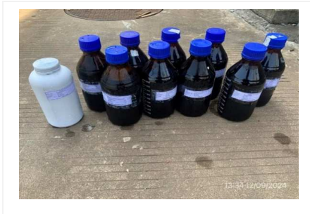
Labelled sample bottles 12/09/2024, 13:34