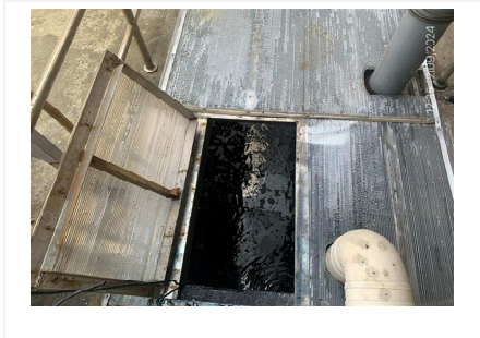
Sampling point 12/09/2024, 12:35