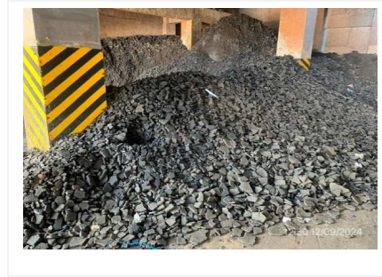
Sampling point surrounding environment 12/09/2024, 12:30