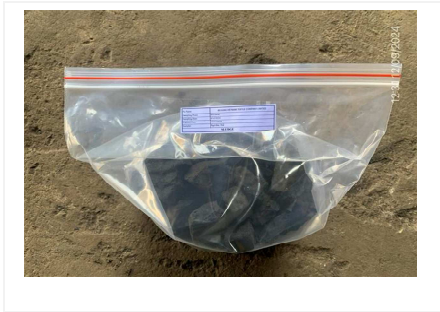
Labelled sample bottles 12/09/2024, 12:31