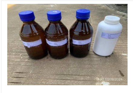
Labelled sample bottles 12/09/2024, 13:32